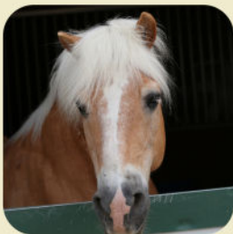
Rocky aka Rockstar